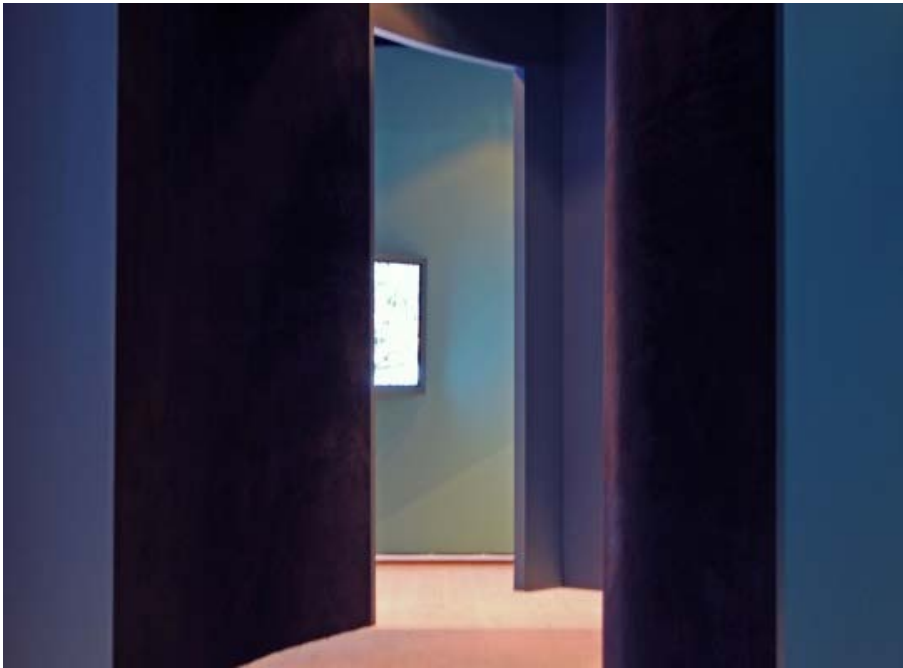
A GLIMPSE OF THE SPACE OF MEMORY WITH ITS IMAGE SCREEN.

In the conceptual stage, the abnormal size of the big blue box was recognised as a communicative device, although it was difficult to categorise this element as art work or architecture, as musical instrument or interactive arena. This triggered creative responses: How could it be used and experienced? What could be learnt? With the 40 cm gap between it and the floor, children could crawl under. Acoustically it allowed for sounds to leak between inside and outside as well as between different passages within The Labyrinth , adding to its maze-like and spatially distributed character. In order to achieve a richly blended sound throughout the work with smooth spatial transitions we had to work with many loudspeakers – some 80 speakers of different sizes, types and positions were installed. We also used the architectural shapes, like rounded walls, openings and closures, different surface structures, and diffusers to form the qualities of the sonic spaces, not as added devices but integrated into the architectural form. The processing was mastered through an advanced computer system. This mode of dealing with sound/noise qualities and the totality of the work was basically a form of musical-architecture. Anders Hultqvist, composer, described this as 'conducting three different symphony orchestras at the same time'.