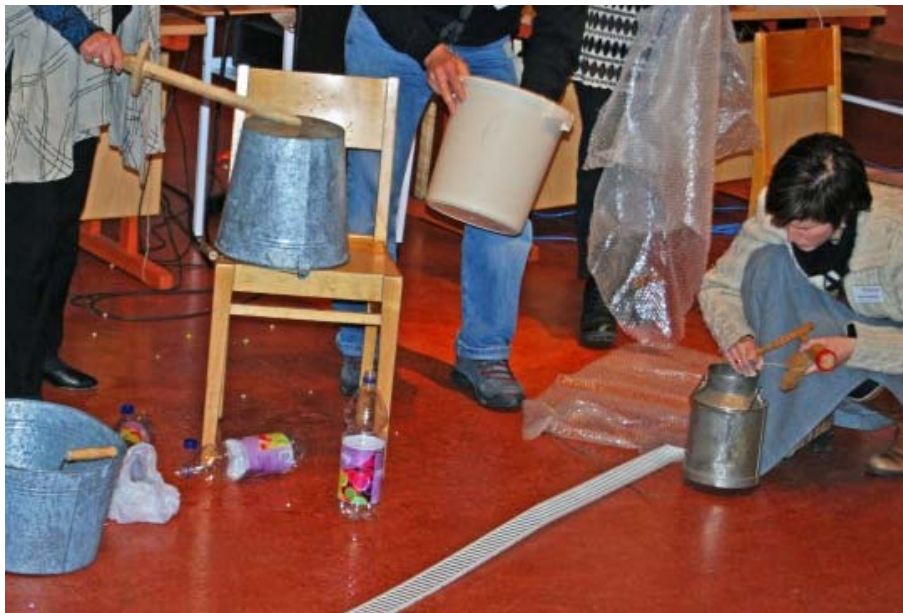
SOUND WORKSHOPS WITH MUSICIANS, PEDAGOGUES AND CHILDREN.

The workshop was playful and fast-moving, and the participants were relieved from any anxieties with respect to sound art and its possible challenges and difficulties. A platform for mutual understanding and trust was established, upon which the artistic qualities of the project could be further developed. The musical-architectural installation concept initiated by Urban Sound Institute had at first been met with some skepticism ("a giant, hanging box with sounds?!"), but it was now fully accepted by the groups involved, and USIT could take the ideas into realisation, with an enhanced awareness of the interaction potentials within the work.