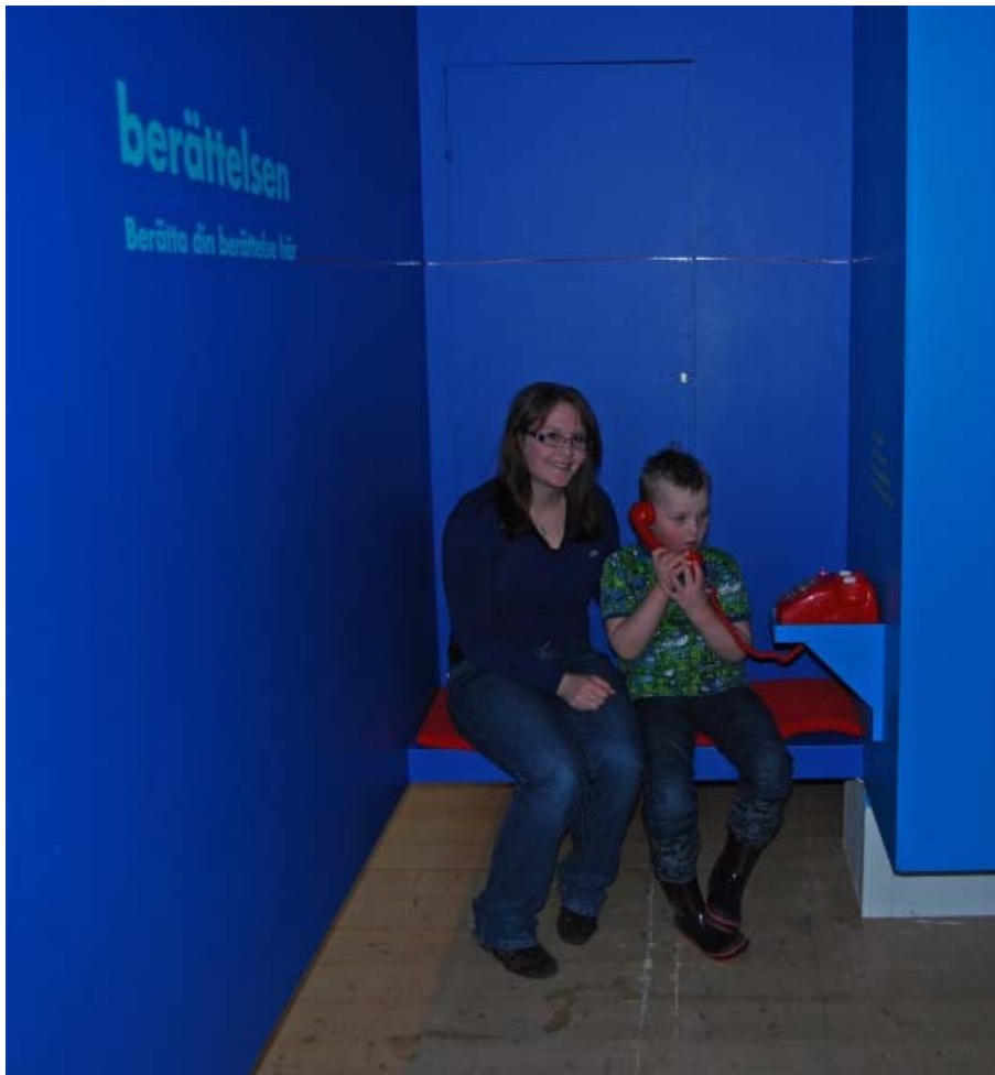
THE ALCOVE WITH A TELEPHONE TO TELL A STORY WHICH WILL REAPPEAR IN THE WHISPERING CHAMBER.

Fragments of the story could be heard as you continued through the passage but also reappeared later in the 'Whispering Chamber' with its 40 hanging loudspeakers. Here the story was mixed with other stories and old tales from the museum's archive as well as with fragments of speech and vocal sounds that dissolved language and emphasised its musical qualities. A 'marinade' of environmental sounds produced from four larger loudspeakers in the upper corners of the chamber was added in order to soften the acoustic atmosphere and create an atmosphere of secretiveness. The story themes in the Whispering Chamber could be remodelled in workshops, e.g. in terms of content (through school workshops, old stories, themes of love, violence etc) or according to sound qualities (different language characteristics, recomposed musical material, close-up recordings of weak sound).