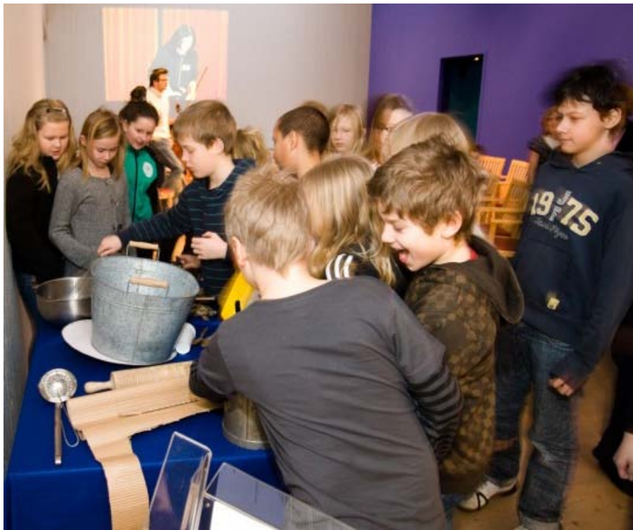
SOUND WORKSHOPS WITH MUSICIANS, PEDAGOGUES AND CHILDREN.

The Terrace was also much used by children, for rest, for experimentation sessions and for play. During one of our visits, some six- or seven-year-olds proudly demonstrated for us the various vibrating areas within the installation. In order to achieve the required bodily scale and adequate frequency range, and cope with the rather thick floor plates, we added a few vibrators, placed underneath. This was in some sense a form of cheating and a question of compromising with respect to the original idea of the work, but it also proved a pragmatic way to render an effect strong enough to give a bodily sensation, as evidenced by the children's engagement.