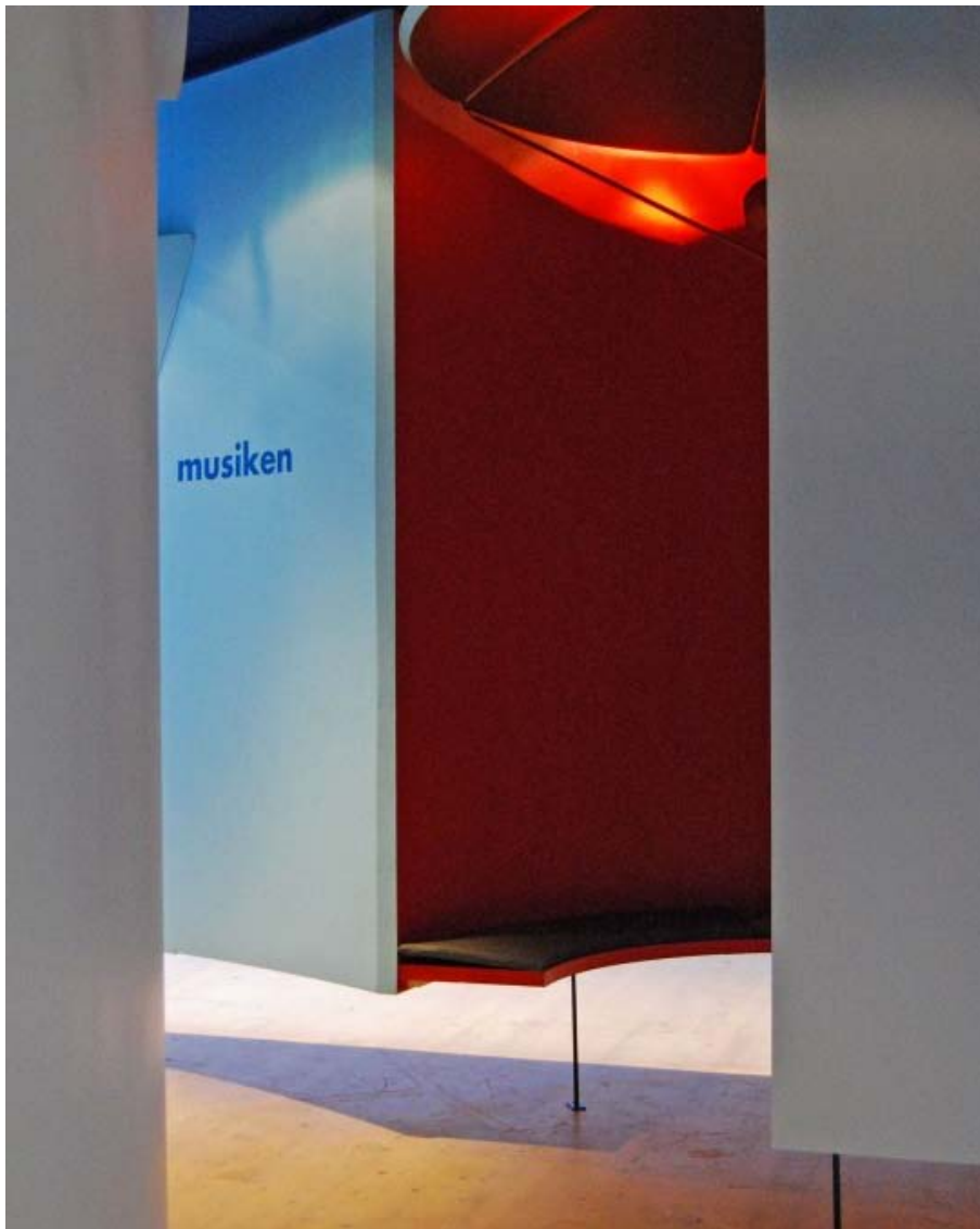
THE MUSIC ROTUNDA WITH ITS PARABOLIC CEILING.

The Body theme was accentuated in a narrow passage where the visitor squeezed through curtains of golden textiles with a soft, brittle sound quality. This material could be alternated with other materials such as wooden sticks, metal chains, paper etc for different aural/bodily experiments.