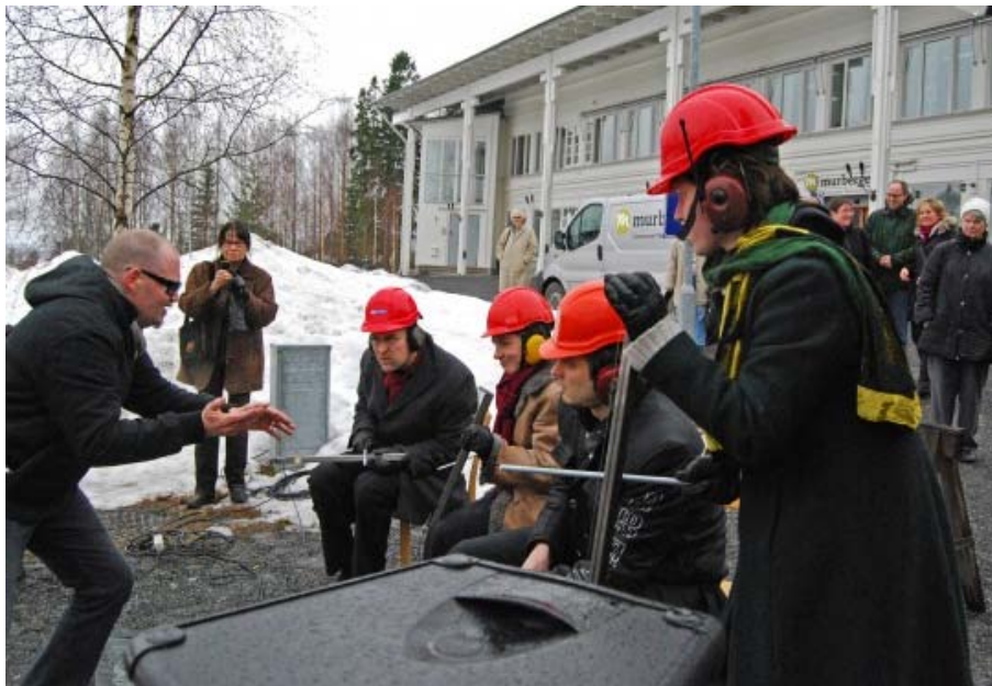
SECOND OPENING, WITH DYNAPAC MACHINES CONCERT AND STEEL "STRING" INSTRUMENTS PLAYED BY THE WEBER QUARTET.

Third perspective: The model as an open research system: outcomes of perspectives 1 and 2