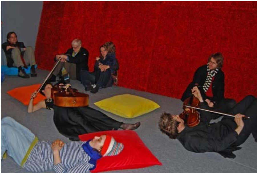
SECOND OPENING, WITH THE WEBER QUARTET PLAYING IN THE VIBRATING TERRACE.

pattern phenomena. With the addition of pillows for sitting on the space was often used for story-telling, reading and music.