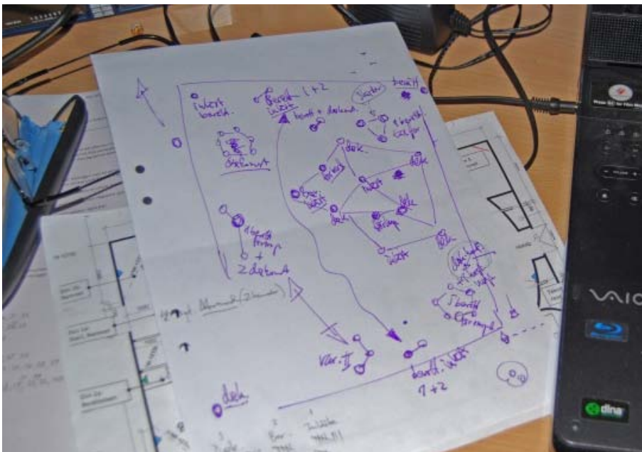
SKETCH FOR SOUND LAYOUT AND THEMATIC CONNECTIONS IN THE LABYRINTH.

In the conceptual stage, the abnormal size of the big blue box was recognised as a communicative device, although it was difficult to categorise this element as art work or architecture, as musical instrument or interactive arena. This triggered creative responses: How could it be used and experienced? What could be learnt? With the 40 cm gap between it and the floor, children could crawl under. Acoustically it allowed for sounds to leak between inside and outside as well as between different passages within The Labyrinth , adding to its maze-like and spatially distributed character. In order to achieve a richly blended sound throughout the work with smooth spatial transitions we had to work with many loudspeakers – some 80 speakers of different sizes, types and positions were installed. We also used the architectural shapes, like rounded walls, openings and closures, different surface structures, and diffusers to form the qualities of the sonic spaces, not as added devices but integrated into the architectural form. The processing was mastered through an advanced computer system. This mode of dealing with sound/noise qualities and the totality of the work was basically a form of musical-architecture. Anders Hultqvist, composer, described this as 'conducting three different symphony orchestras at the same time'.