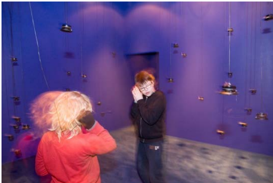
THE WHISPERING CHAMBER IN THE LABYRINTH, WITH FRAGMENTS OF STORIES, SPEECH AND MUSICAL SOUNDS.

We did not want to limit the use of the museum's archive material to a documentary mode employing the material as illustrations of a regional culture or what Rick Altman and James Lastra refer to within sound editing as representations of sounds, presenting an expanded but still causal relationship between "original" and "postproduction" (Altman 1992, p.40 Lastra 1992, p.70). Instead, we wished to enhance the musical qualities (intonations of dialects etc.), and give a special character to the spatial setting. Combining this with the stories, and encouraging other experiments by the users with language, sound and space.